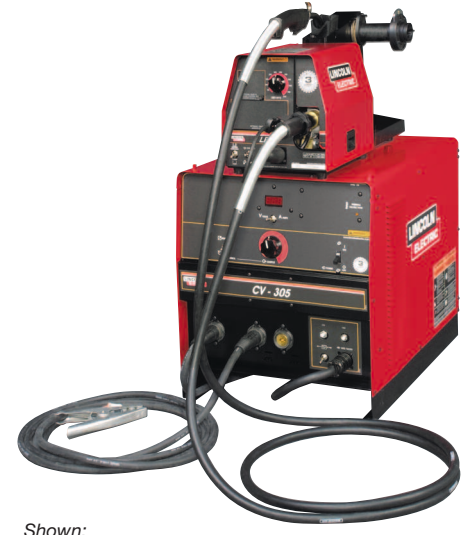
CV-305 / LF-72 Wire Feeder Ready-Pak® Package

(Order Swivel Kit K2332-1 for even more flexibility! Note: Can't be used at the same time with undercarriage while gas cylinder(s) are installed.)