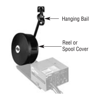
Hanging Bail #058 435 Suspends feeder over the work area.

Reel Cover #195 412 For 60 lb (27.2 kg) coil.