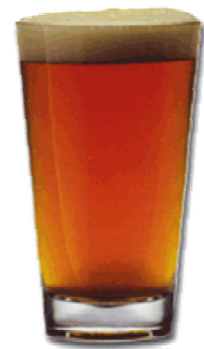
The BeerBlast™ for the perfect mix!

The BeerBlast™ provides the exact gas mix required, protecting the kegged product quality, eliminating over foaming or under carbonation, increasing yields/profits, and ultimately satisfying the customer, which increases loyalty. South-Tek’s line of BeerBlast™ systems creates its own 99.8% pure N 2 from the air and in turn blends it with the correct ratio of CO 2 thus reducing your operations efforts and costs, while maintaining product quality.